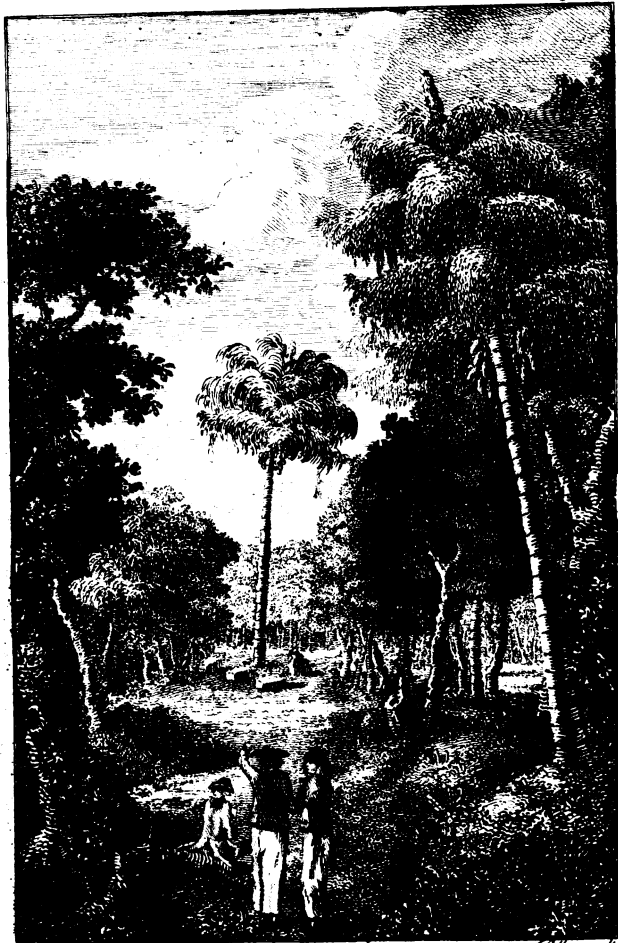
A Grove with an Altar of Stones, supposed to be a place of Worship?