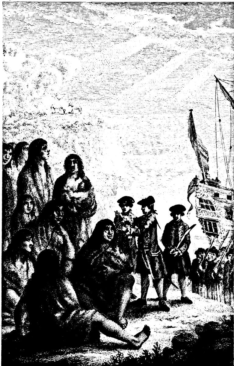
The Commodore making Presents to the Patagonians.