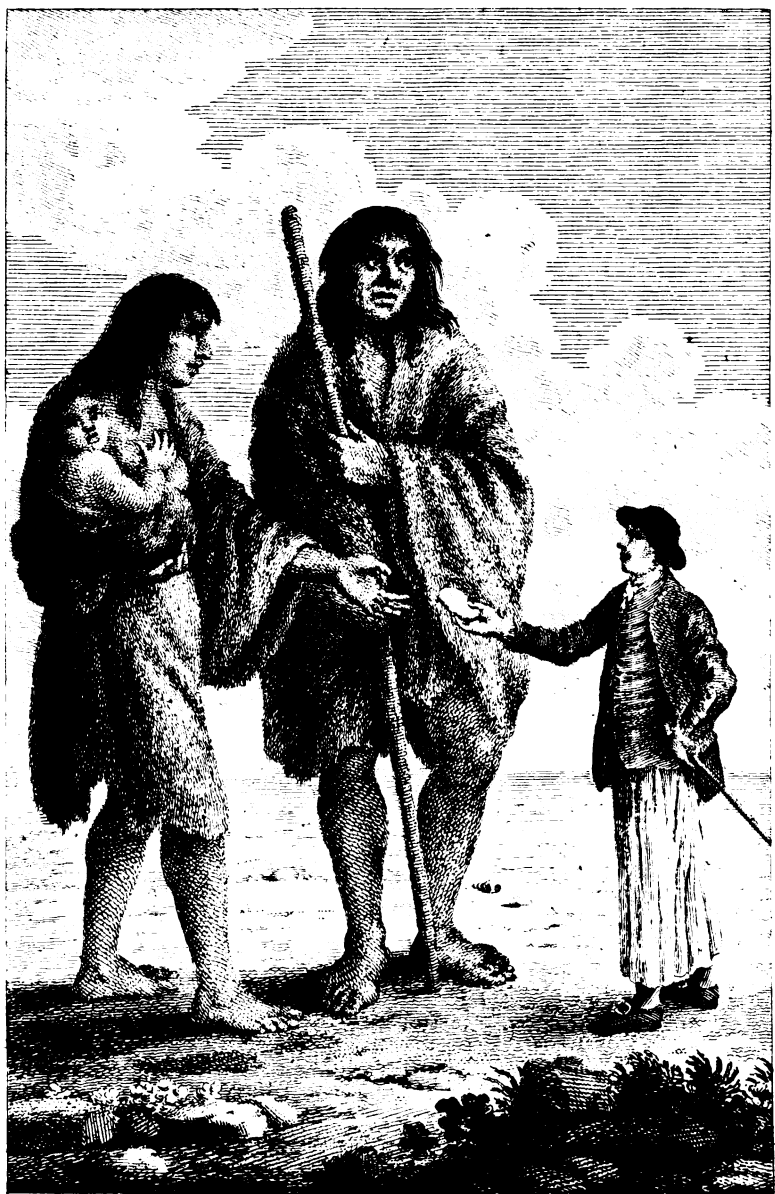
A Sailor giving a Patagonian Woman some Biscuit for her Child.