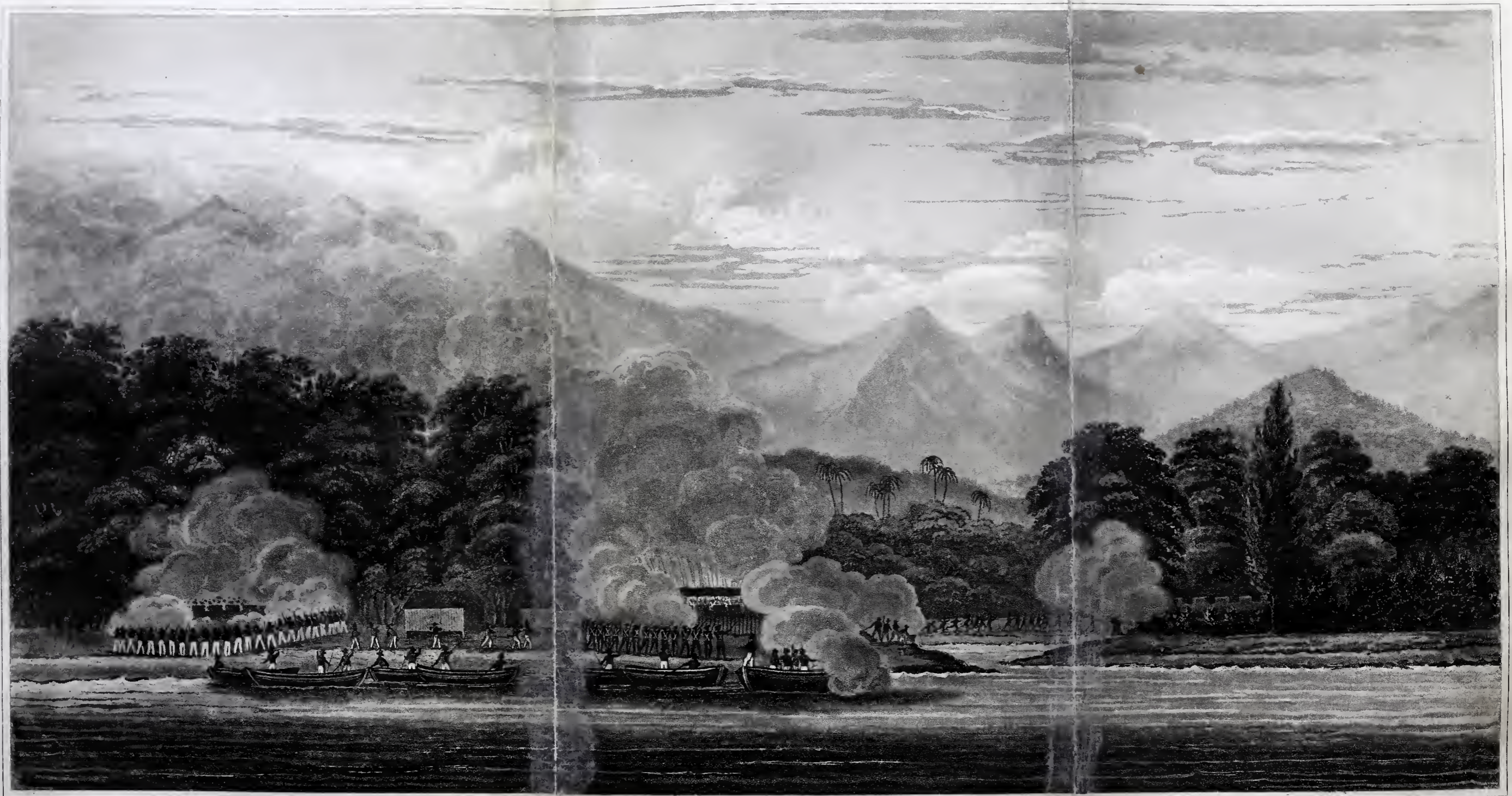
ACTION OF QUALIAH BATTOKA, SEEN FROM THE POTOMAC AT ANCHOR IN THE OFFING; J. DOWNES ESQ. COMMANDER. FEB 5 1832.