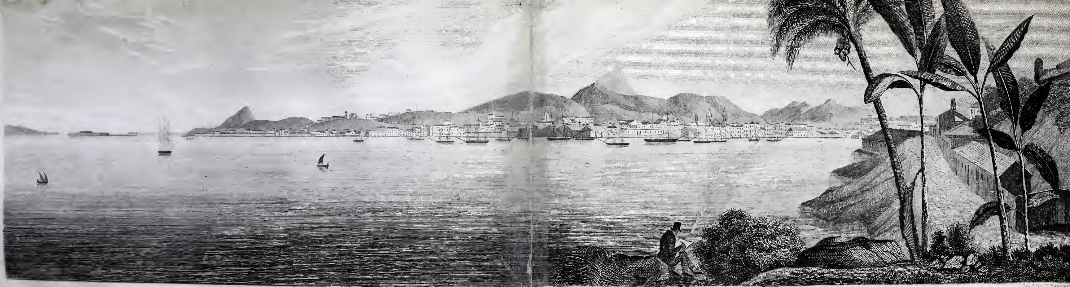
VIEW OF RIO JANIERO