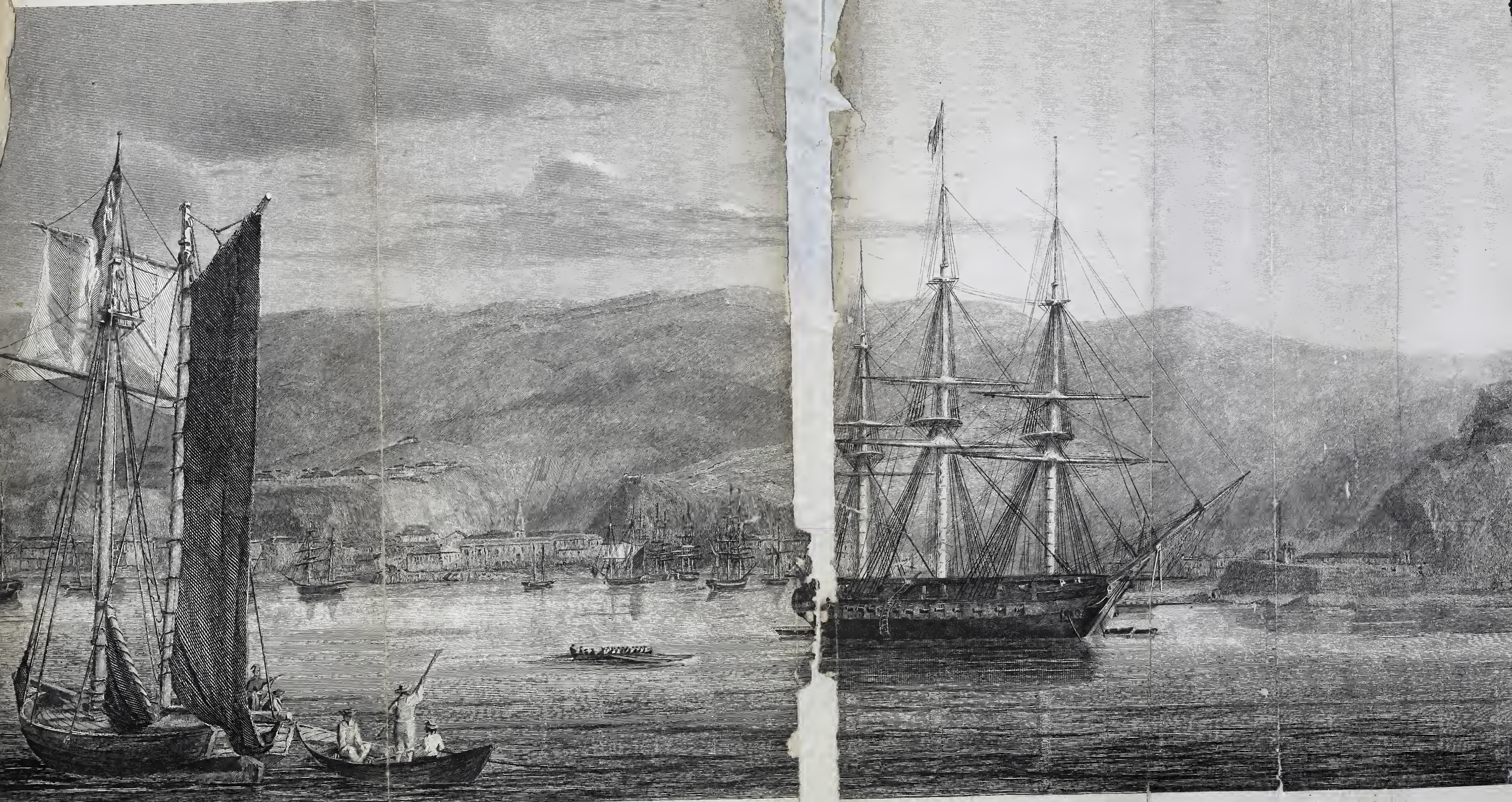
VIEW OF THE HARBOUR AND TOWN OF VALPARAISO.