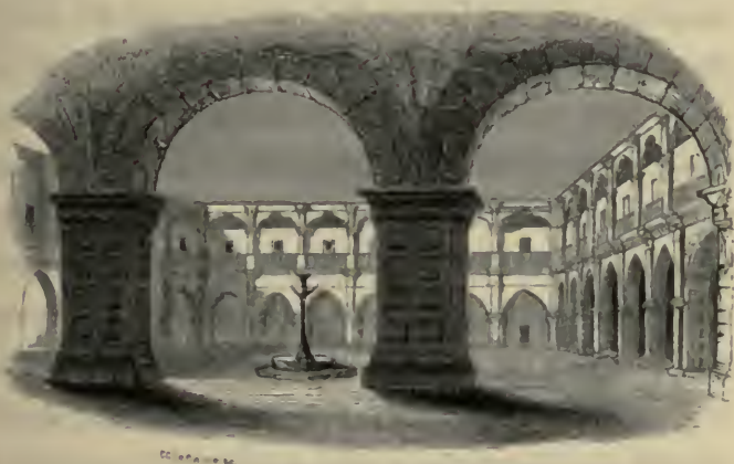
SECOND COURT OF CONVENT.

The Franciscan Monastery is one of the places most worthy of note in Lima. It was formerly inhabited