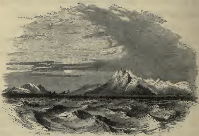
VIEW OF CAPE HORN.

Humboldt, in his Cosmo , says, that Cape Horn was discovered in February, 1526, by Francisco de Hoces, in the expedition of the Comendator Garcia