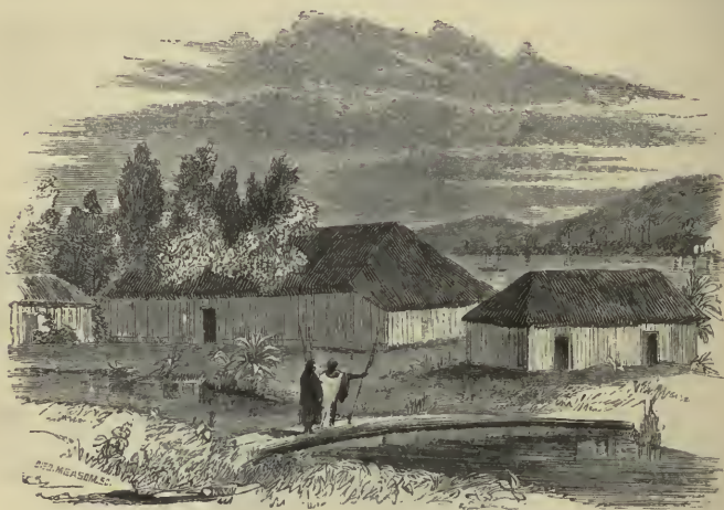
RESIDENCE OF POMARE.

Her house was good, and she had a large suite of followers, who maintained all the respect her position then demanded. The Kings of the islands inveighed