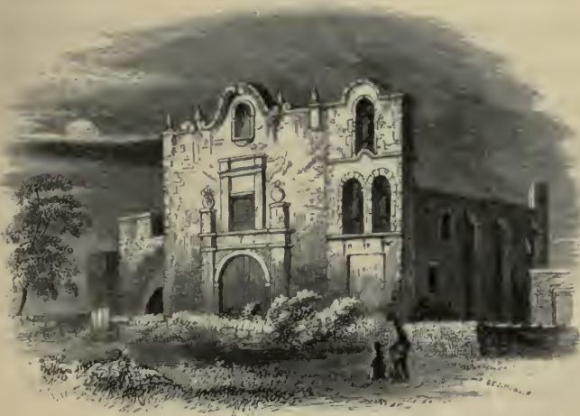
PRESILIO SAN BLAS.

The early part of next day was spent in sauntering about the town of St. Sebastian. The barber, on a second visit, was teaching dancing, he himself playing the fiddle. After many regrets and kind speeches, we left, and reached Mazatlan late in the evening, when, after a further stay of some time, and sending our remembrances and some small presents to the owner of the mines, we sailed for the northward.