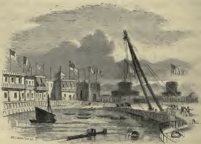
CALLAO FROM THE MOLE HEAD.

The town is cleaner than might be expected from such notions ; their pretty Rimac turned in, runs and sparkles through its streets, bubbles in its fountains, and gurgles in its gardens. Refuting calumny, it bustles about, and cleans all, and the city is not more unhealthy than others. Turkey-buzzards (galingas) do all the dirty work, and sit about lazy and tame as if they liked it and were not at all afraid. Do they breed in the city, or are they country buzzards who hear of the pleasures of a town life, and leave picking and scratching, and come up here to live like gentlemen ?