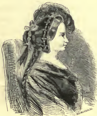
PORTRAIT OF POMARE.

The parties then left for the foot of Vaion, where the Queen was on a visit, and she was at last found on a small island, with her mother and two children, neatly dressed in black silk gowns, cut in the native fashion, and Panama hats. Pomare Tani (her husband) sat by in a seedy dress of dungareen, smoking a cigar, and seemingly quite indifferent.