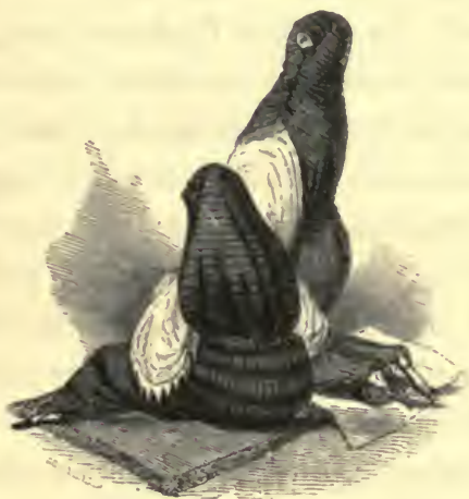
LADY IN THE VEIL AND SAYA.