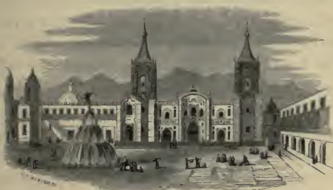
SQUARE WITH FOUNTAIN.

imposing: that it is only lath and plaster, and that those massive pillars are hollow, need not be known. On two other sides are pretty Venetian-looking buildings, two stories high, with large colonnades that make a nice sheltered walk, and above are closed latticed balconies. The fourth side has the president's palace, formerly the vice-regal one, as ugly