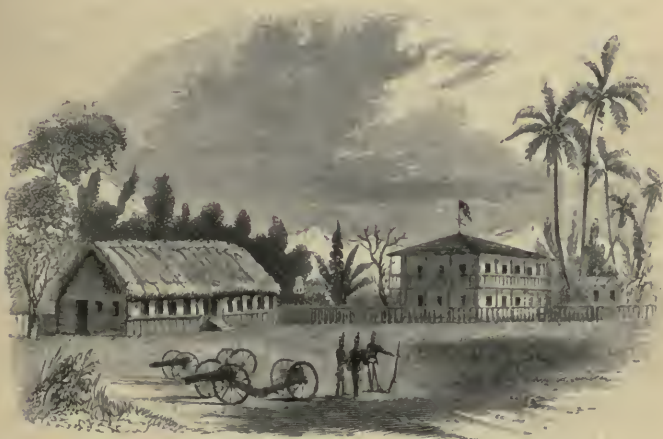
PALACE OF POMARE AND FRENCH GOVERNOR. TAHITI.

The French are accused by the natives of having introduced all manner of horrors. The shark was never known, they say, within the bay till after their arrival. A French store-ship sank in the harbour full of provisions; this, probably, allured the rapacious creatures, and since then, bathing in the sea is quite out of the question. Not only the common shark whose fin generally heralds his approach, but the far deadlier ground one now haunts the shore.