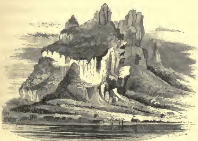
PEAK OF BORABORA.

curred, there frowned the peak, high up, high up, with his bald benign head, as if to catch the lofty breeze which waved about him, but passed high over us. At last the forms of natives, as they peered out of the woods and darted back again, showed us we were near the place of rendezvous, and turning a corner, we found about four hundred men and women assembled.