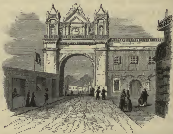
GATE OF LIMA.

about him. A French sailor, who was a fellow-passenger, compared the motion of the omnibus to a vessel in a short head sea: the simile could not be improved on. The houses are not fine, nearly all being of one story only, and presenting but one or two grated windows to the streets. The city, being laid out in regular squares, had a sombre