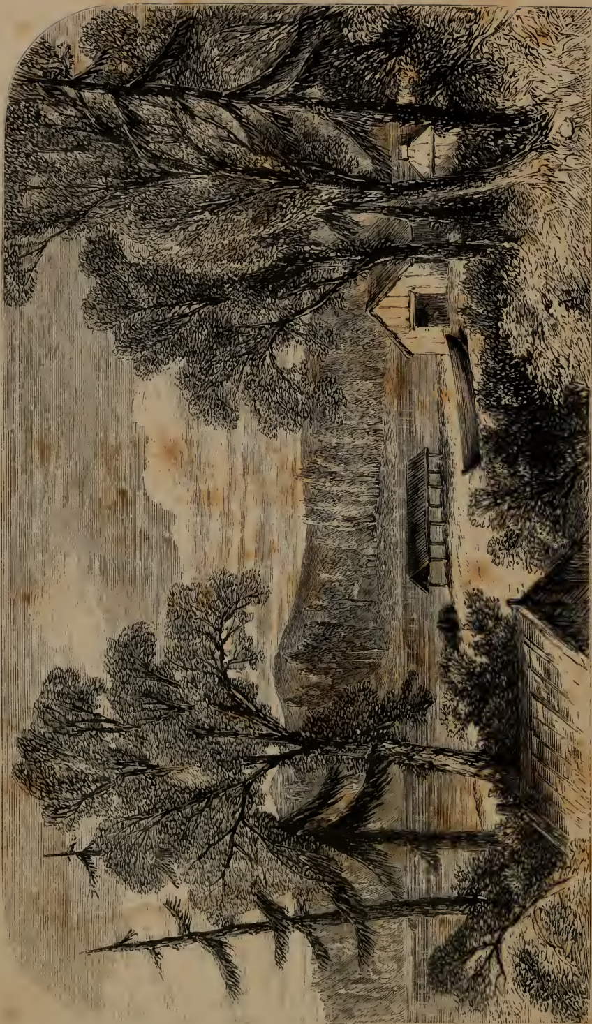
ESQUIMAULT HARBOUR, VANCOUVER'S ISLAND.