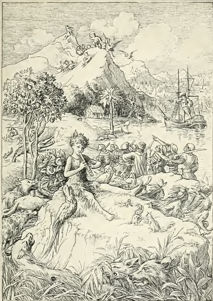
THE NEVER NEVER LAND