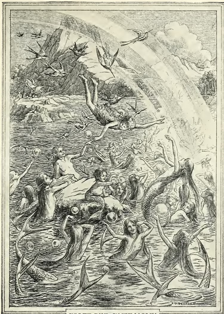
SUMMER DAYS ON THE LAGOON