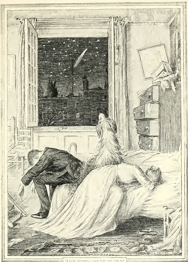
THE BIRDS WERE FLOWN