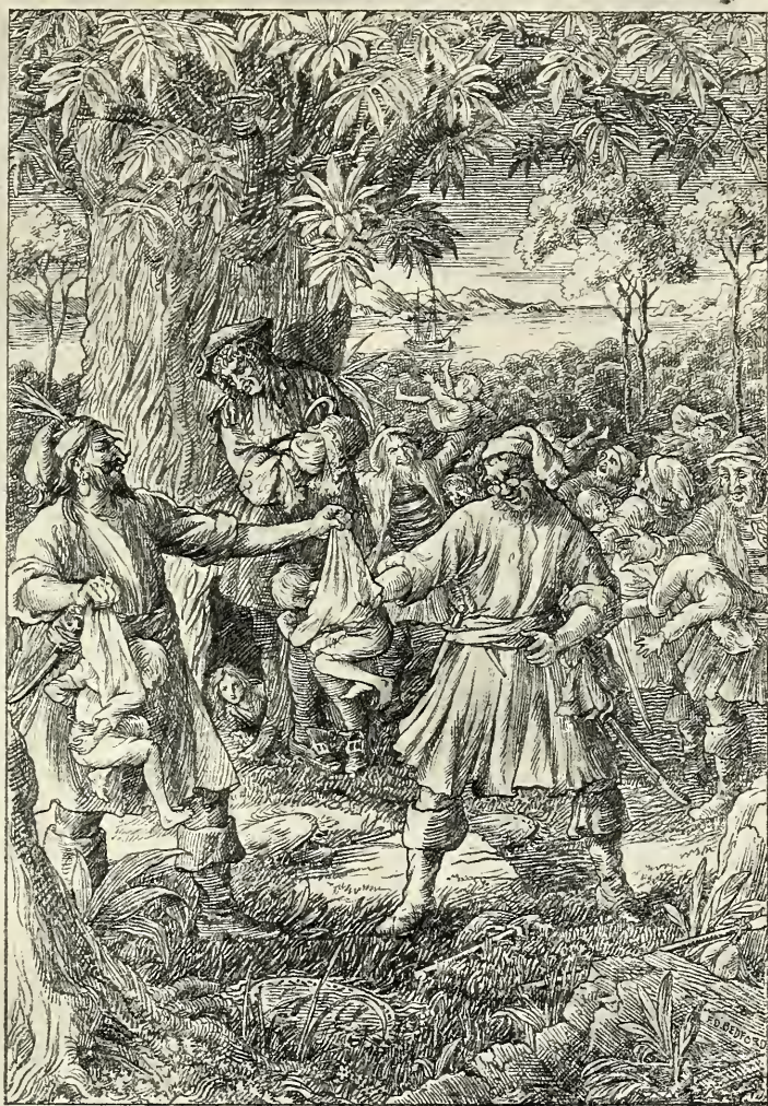
FLUNG LIKE BALES